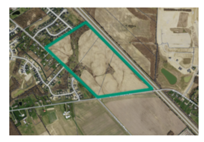
DUBLIN CITY SCHOOLS An aerial view of the land Dublin City Schools bought.

The district paid about $6.7 for the land acquisition, at Industrial Parkway and Mitchell DeWitt Road along U.S. Route 33 in Plain City. The property 2.5 miles from Dublin Jerome High School.